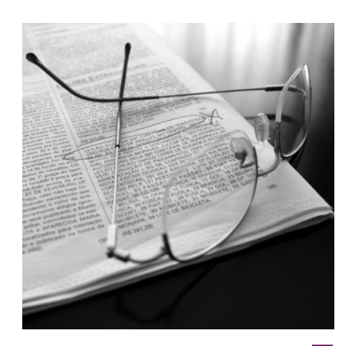
A SUCCESSFUL SALON 5

Franchise: The right under which a person or company (FRANCHISEE) may market a product or provide a services, as granted by the proprietary owners (FRANCHISOR). The contract, defining the terms and conditions, between franchisor and franchisee is called a FRANCHISE AGREEMENT. Often a franchise is exclusive for a specified area.